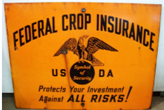
Several Good Porcelain Advertising Signs