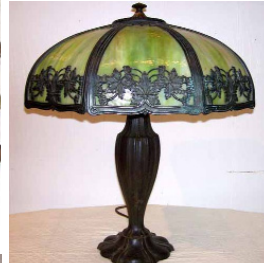
Quality Lighting incl. 4 Panelled Lamps & Amronlite Desk Lamp