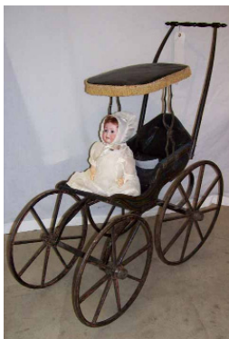
Estate Bisque Dolls & Accessories