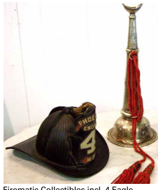
Firematic Collectibles incl. 4 Eagle Crested Helmets, Pres.Horn, Lamp