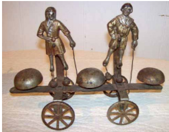
Several Quality Iron & Tin Toys