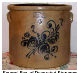
Several Pcs. of Decorated Stoneware