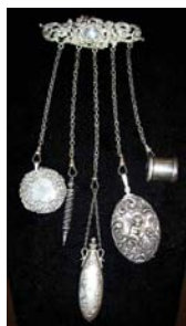
Sterling Chatelaine & Estate Jewelry