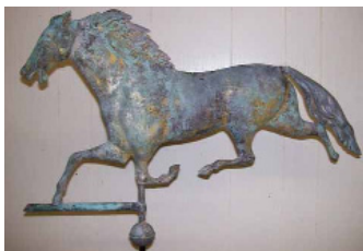
3 Early Weathervanes incl. this Running Horse, St. Julian & Rooster