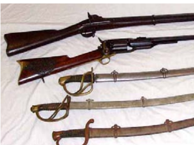
Civil War Era Firearms, Swords, Photos & Accessories