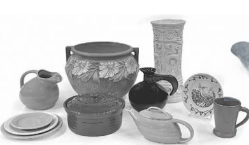
Extensive collection of art pottery including Roseville, Weller, and Bauer (to be offered both Saturday and Sunday)

From Your House to Our House Call us to appraise and sell your fine items Live and Online Bidding! clars LIVE AUCTION