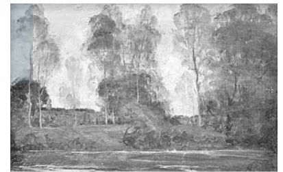
Henri-Joseph Harpignies (French, 1819-1916) Framed oil on board, Bords de la Loire , 6" x 9"