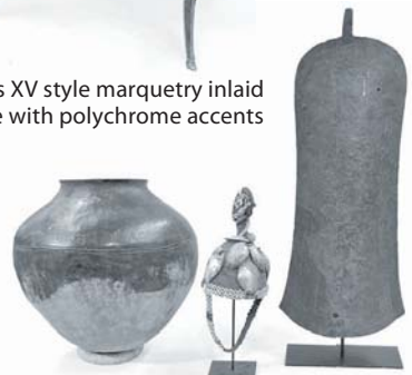
Collection of African wood and bronze sculptures, pots, and currency (to be offered on Saturday)