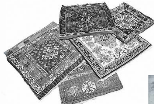
Selection of antique Persian textiles