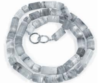
Tiffany & Co. Paloma Picasso opal cat's eye necklace set with 41 beads, stamped Paloma Picasso Tiffany & Co., 18k yellow gold 16mm interlocking circle clasp