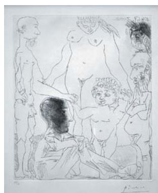
Pablo Picasso (Spanish, 1881-1973) Framed etching, Reflexion du peintre sur la vie , 1967, edition of 50, 13.5" x 11.5" (one of three to be offered)