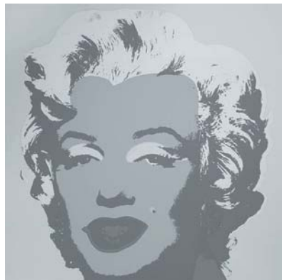
Andy Warhol (New York, 1928-1987) Unframed screenprints, Marilyn Portfolio , published by Sunday B. Morning, 36" x 36" (one of three portfolios to be offered)