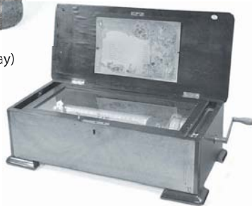
Swiss Cylinder music box, 24" w