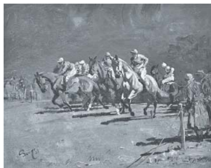
Edward Seago (British, 1910-1974) Framed oil on canvas, The Start , 1933, 16" x 20"