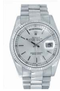
Rolex Day-Date President watch, 18k gold, fluted bezel, champagne dial, model number 118238