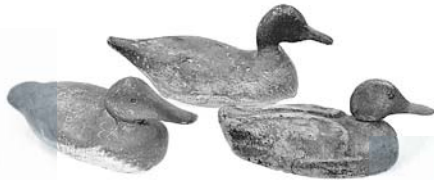
Selection of 19th century duck decoys (to be offered on Saturday)