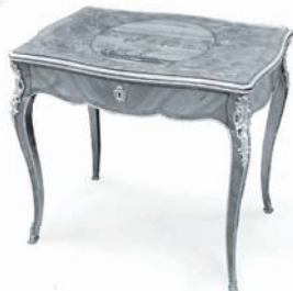
Louis XV style marquetry inlaid table with polychrome accents