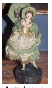
Andenken wax doll, Paris, France