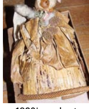
1920's walnut head mammy doll