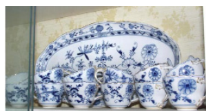
Meissen fish platter