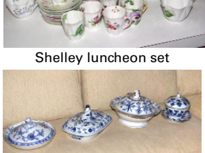
Shelley luncheon set