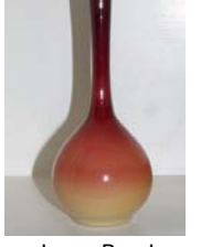
glossy Peach Blow vase

DIRECTIONS: FROM CT, take 95 north to exit 5A (102 S). follow 102 S, cross over Rt 3 and continue on 102 for approx 9 mi. Temple is on left.