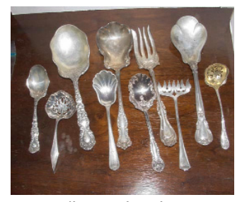
sterling serving pieces