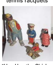
"Hey Hey the Chicken Snatcher" toy