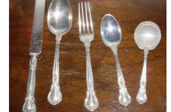
44 pc sterling flatware set