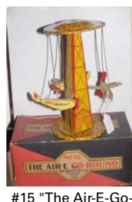
#15 "The Air-E-Go-Round" toy