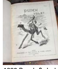
1883 Punch & Judy books