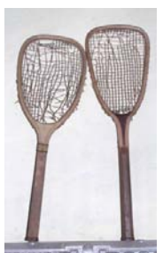
pr of flat top tennis racquets