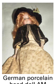
German porcelain head doll AM