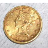
1866 and 1912 $5 gold coins

WASHINGTON LODGE MASONIC TEMPLE • 1515 TEN ROD RD, NORTH KINGSTOWN, RI • 401 265-5104