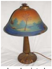
hand painted lamp