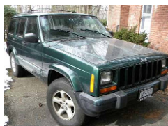
1999 Jeep Cherokee