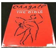
Rare Chagall plate book