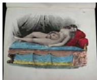
Early Medical books & more