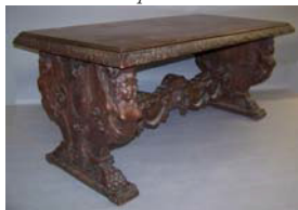
6' heavily carved claw foot table with winged figures and lion heads