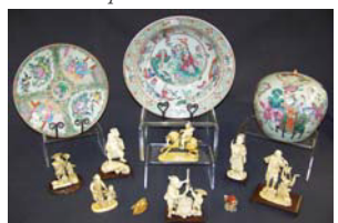
Sample of ivory collection & Chinese porcelain