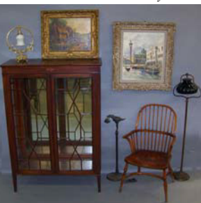
Sample of Antiques & Accessories

Preview: Friday, March 12 & Saturday, March 13, 10 AM - 4 PM Fine art, silver, art glass, lighting, furniture, rugs, fine jewelry, clocks, ivory, porcelains, pottery. There will be approx. 500 lots incl. 150 pieces of furniture. Preview online for complete photo catalog. Live bidding available through Artifact. God Bless!