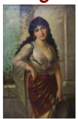
Al Brentano, The Italian Beauty, o/c