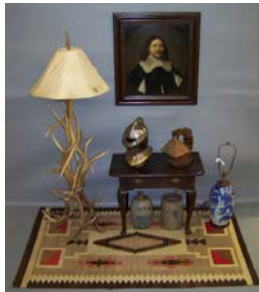
18th century Queen Anne table, Old Master painting, Indian rug & miscellane-