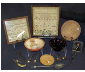
Sample of Folk Art, Treenware & country