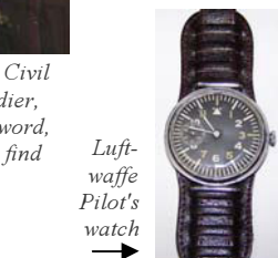
Luft- waffe Pilot's watch