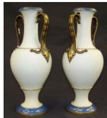
Exquisite Meissen vases