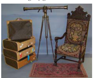
Louis Vuitton suitcases, antique range finder, Sarouk & exquisite carved arm chair