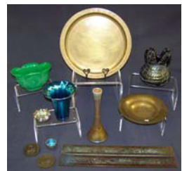
Tiffany, Loetz & Steuben