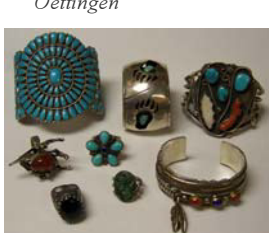
Silver & Turquoise Indian Jewelry