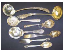
Approx. 100 lots of Sterling incl. Kirk, Strasbourg, Jensen, Francis, Lily of the Valley, Dansk, Kentucky & Virginia Coin