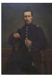
Victorian Civil War Soldier, holding sword, o/c, rare find