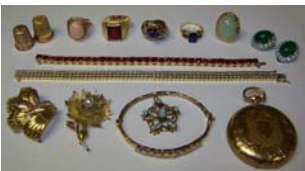
Sample of 14 and 18 kt jewelry, exquisite ruby bracelet & gold pocket watch