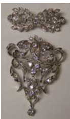
Exquisite 18k diamond pendants