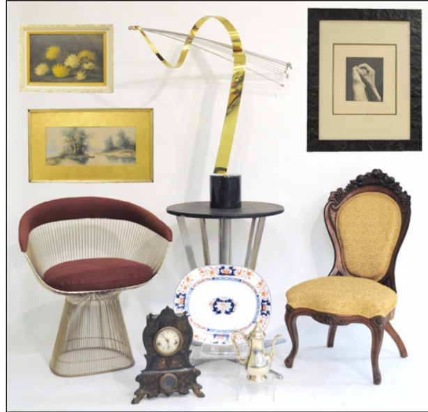
Platner chairs (set of 6), C. Jere sculpture, H. Moore lithograph, one of a Belter pair (attrib.), etc.

LOCATION: 20 mins. West of Hartford, CT. Approx 2 hours from NYC or Boston.