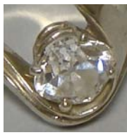
3.5 cts. Cushion Cut Diamond