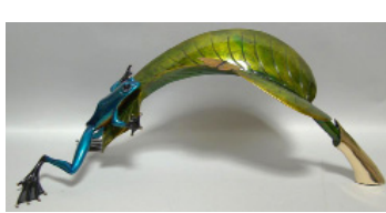
Tim Cotterill 'Over the Top, 2005' Cast bronze, length: 28 1/4 in.