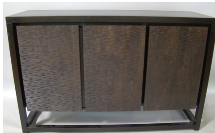
Roche Bobois Nairobi Three Door Buffet