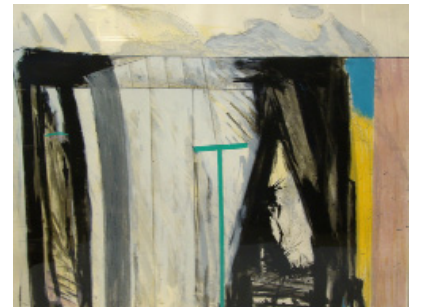
Ramiro Llona (Peru 1947-) 'Doors' Silkscreen: 31 1/2 x 39 in. I.r. signed & dated