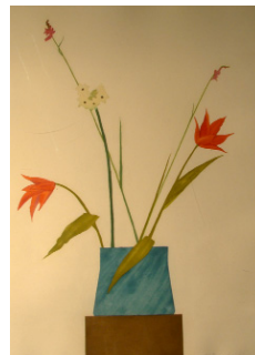
Ed Baynard (Am. 1940-) 'Composition with Tulips' Hand colored aquatint on paper: 42 x 29 1/2 in. I.r. signed