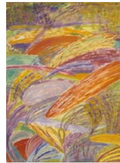
Susan Moss (Am. 1944-) 'Red Longitude' Oil and graphite on paper: 34 x 26 in. I.r. signed