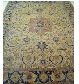
Large Tabriz, 9 1/2 x 13 feet