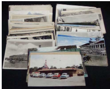
1,000s of postcards