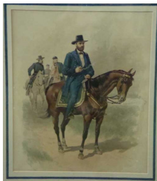
Civil War prints, bond currency, newspapers