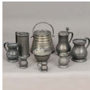
Assorted pewter articles