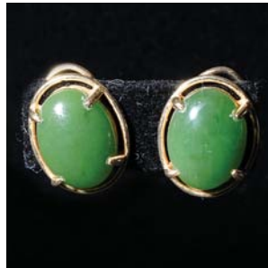
From a selection of jewelry