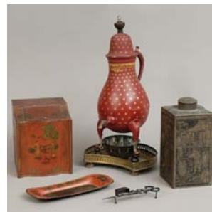
From a selection of toile-painte articles