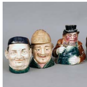
From a collection of tobacco jars