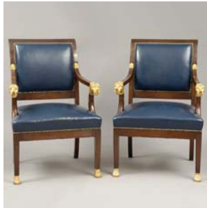
Eight Empire-style parcel-gilt and carved mahogany armchairs