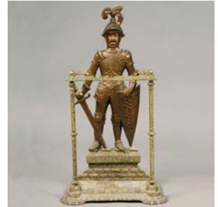
Painted cast-iron figural umbrella stand