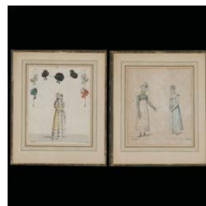
From a group of early 19th-century fashion prints