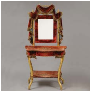
Napoleon III giltwood and embroidered velvet faux-bamboo dressing table