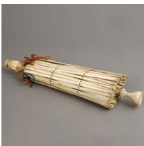
Scrimshaw whalebone and ivory yarn swift