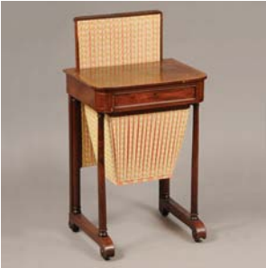
Regency brass-inlaid mahogany work table