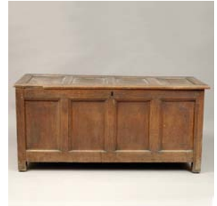
English oak paneled chest