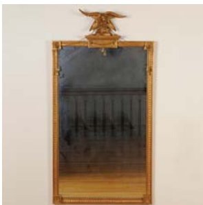
Federal-style giltwood wall mirror