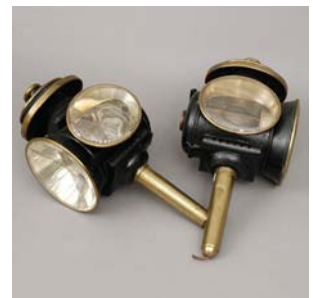
Pair of brass and toile carriage lamps