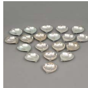
Nineteen Tiffany & Co. sterling silver leaf-form dishes