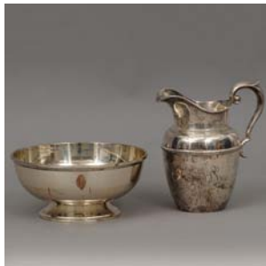
Gorham sterling silver water pitcher and a bowl