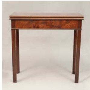
George III-style mahogany games table