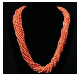
From a selection of jewelry

VIEW AN ILLUSTRATED ONLINE CATALOGUE AT WWW.STAIRGALLERIES.COM