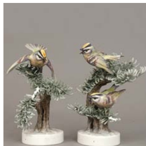
Two Royal Worcester polychrome biscuit porcelain bird figures