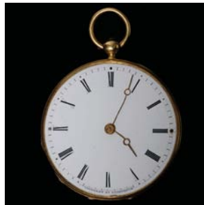
From a selection of jewelry