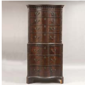
George III-style mahogany chest on chest