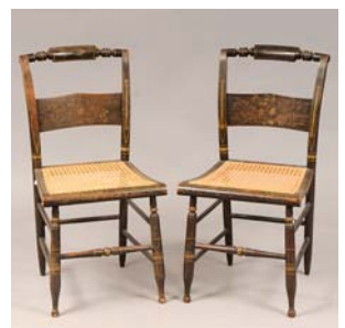
Pair of Late Federal grain-painted and gilt-stenciled side chairs