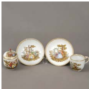
From a selection of Meissen porcelain table articles