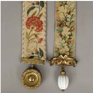
Two Victorian needlework bell pulls