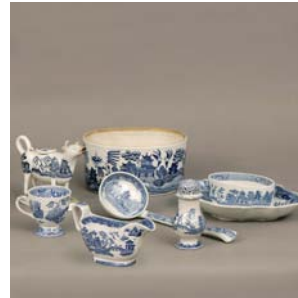
'Blue Willow' transfer-printed pottery articles