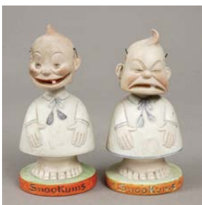
From a collection of bobbing head figures