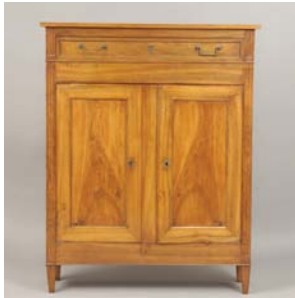
Directoire-style brass-mounted mahogany cabinet

Over 700 Lots of American, English and Continental Furniture, Pottery & Porcelain, Silver & Silverplate, Metalwork, Glass, Rugs & Carpets, Decorations, Books & Ephemera and Jewelry in Addition to a Large Collection of Bobbing-Head Figures. Featuring the Contents of a New York City Home.