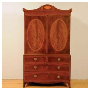
George III-style inlaid mahogany linen press