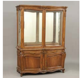
Louis XV-style carved walnut china cabinet