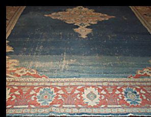
Antique Mahal rug 1900's 13ft 2" x 9ft 9"