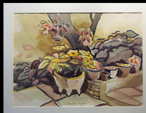
George Post watercolor 17 1/2" H x 23 1/2" sight size