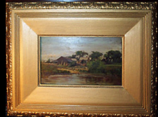
Charles Alvah Walker o/b 6" H x 20" W sight size