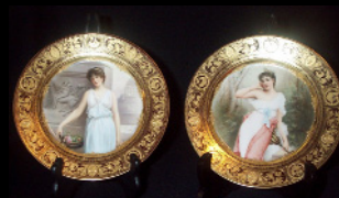
Two fine German porcelain 9" plates, blue beehive mk., one sign. Wagner 2nd plate sig. Indecipherable