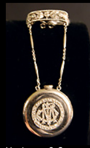
Vacheron & Constantin Platinum & Diamond watch pin