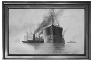
Oil on canvas depicting the bow of a steamship