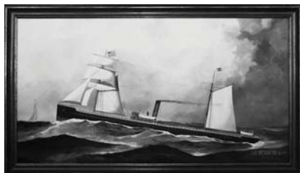
Oil on canvas depicting the "SS. Bermuda"