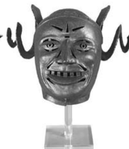
19th century Victorian "Medieval Punishment Mask." 14"H x 18"W