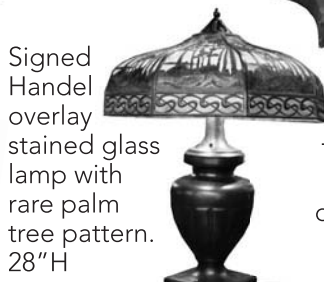
Signed Handel overlay stained glass lamp with rare palm tree pattern. 28"H