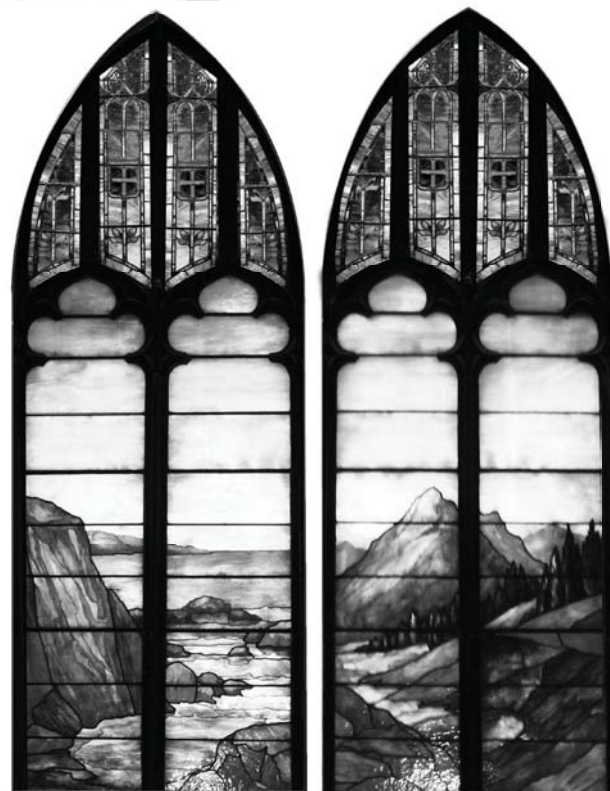
Amazing Gothic arched layered and plated stained glass windows by Lamb Studios depicting landscapes of the sea and mountains. 16½'H x 6'W each