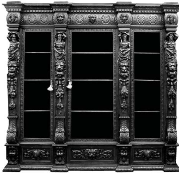
Tri-glass-door bookcase, intricately carved with atlas and lion figures. 7'H x 7'W