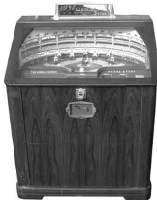
Extremely rare and valuable 1937 World Series Baseball Game by Rock-Ola. An amazing collector piece from Yellowstone Club. 54"H x 41"W