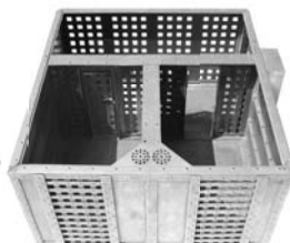
Remarkably detailed sample of a 19th century jail with moving parts by Diebold. 6½"H x 12" Square