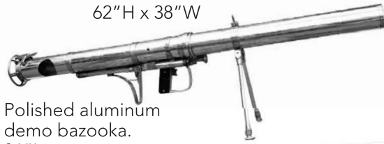
Polished aluminum demo bazooka. 36"L