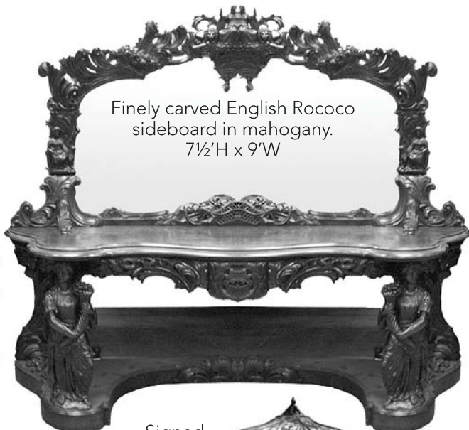
Finely carved English Rococo sideboard in mahogany. 7½'H x 9'W