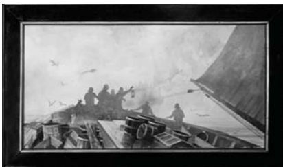
Oil on canvas depicting a fisherman rescue

Incredible collection of paintings by New England artist Edward Fay.