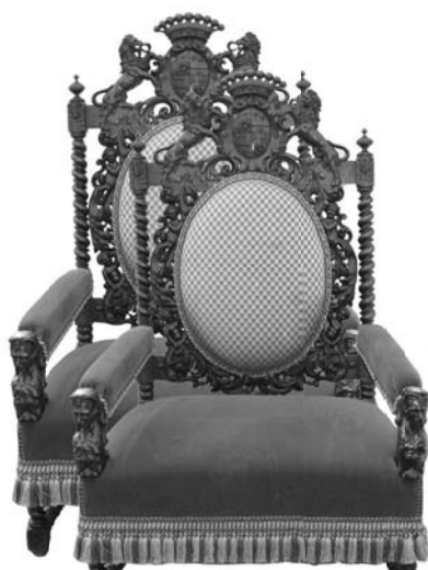
A pair of ornately carved oversized walnut arm chairs topped with crests flanked with lions. 62"H x 38"W