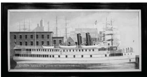
Oil on canvas Steamship "Sankaty"