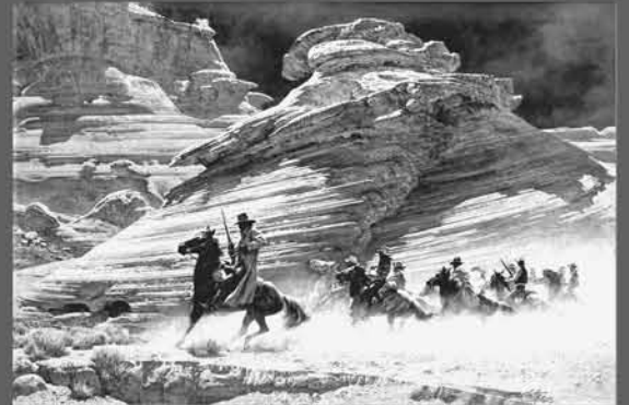
Frank McCarthy, Dust Stained Posse 24 x 36 inches - Est. $50,000 - $70,000