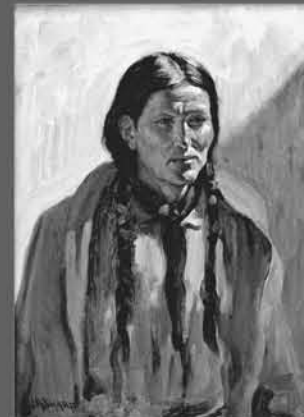
Joseph Henry Sharp, Corn Star Pueblo 14 x 10 inches - Est. $80,000 - $120,000