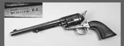
Colt, Single Action Army - Inspected by Ainsworth Est. $12,000 - 15,000

Visit www.altermann.com for more information and to view the online catalog. A printed catalog is available from the Gallery for $45