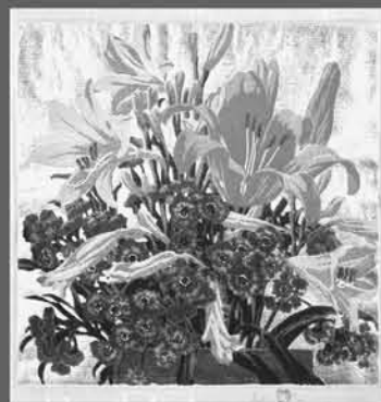
Gustave Baumann, From A Hillside Garden 12¼ x 12¼ inches - Est. $8,000 - $12,000