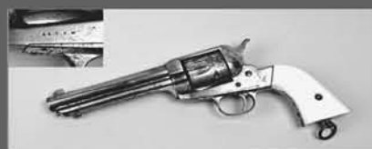
Remington 1890 with Ivory Grips Est. $5,000 - 7,000