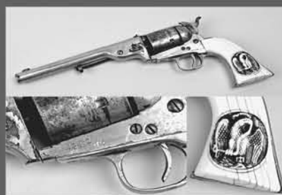
Colt, 1871-72 with Mexican Ivory Grips Est. $10,000 - $12,000