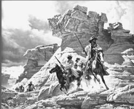
Frank McCarthy, The Whine of a Ricochet 24 x 30 inches - Est. $40,000 - $50,000

AUCTION - SUNDAY, NOVEMBER 8, 2009 - 1:00 P.M. 345 CAMINO DEL MONTE SOL, SANTA FE, NM 87501