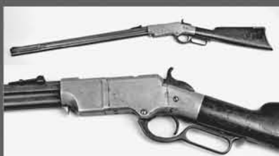
Henry Rifle, Serial No. 2291 Est. $60,000 - $80,000