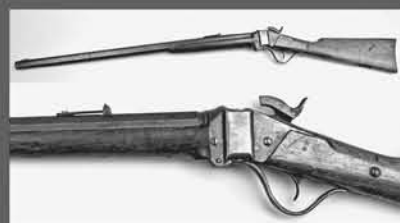
Sharp's 1874 Buffalo Gun Est. $45,000 - $65,000