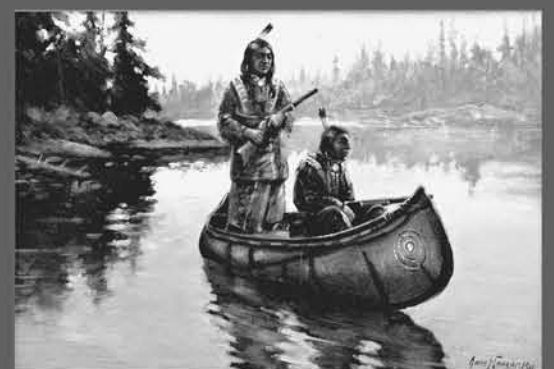
John Hauser, Hunters in Canoe 9½ x 13½ inches - Est. $9,000 - $12,000