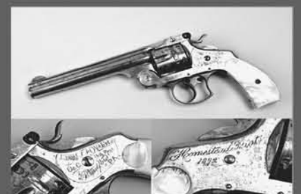
Smith & Wesson DA Frontier w/Homestead Riot Inscription Est. $5,000 - $7,000