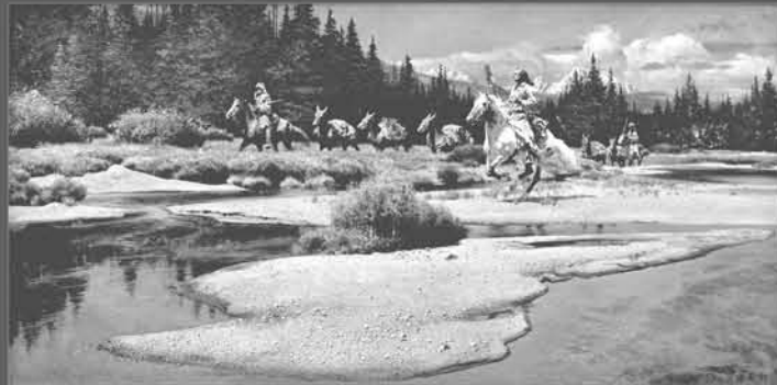
Frank McCarthy, In The Land of The Sparrow Hawk People 18 x 36 inches - Est. $130,000 - $160,000