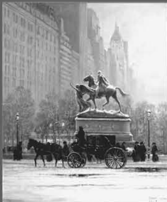
G. Harvey, Fifth Avenue 36 x 30 inches - Est. $80,000 - $100,000