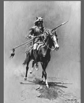
Frank McCarthy, Kiowa Warrior 16 x 12 inches - Est. $13,000-15,000