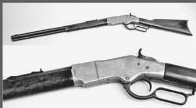
Winchester, 1866 Est. $9,000 - $12,000