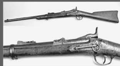
Springfield 1st Model Trapdoor Carbine Est. $8,000 - $12,000