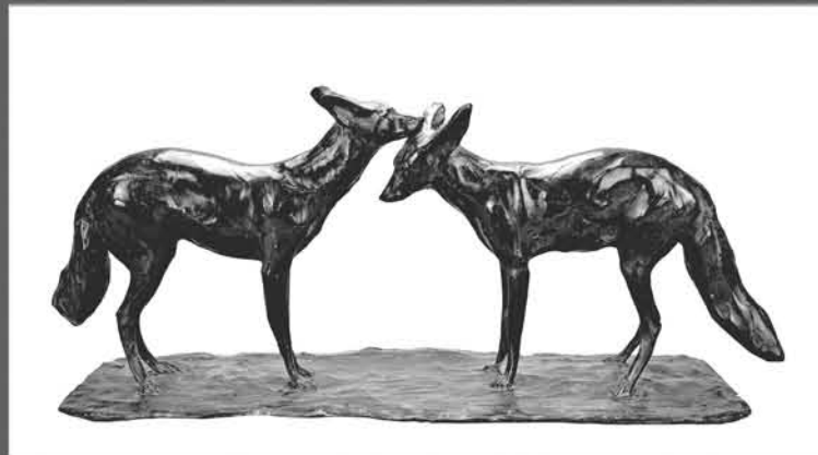
Rembrandt Bugatti, Les Deux Chacals Bronze, 10 x 21½ x 7 inches - Est. $130,000 - $160,000