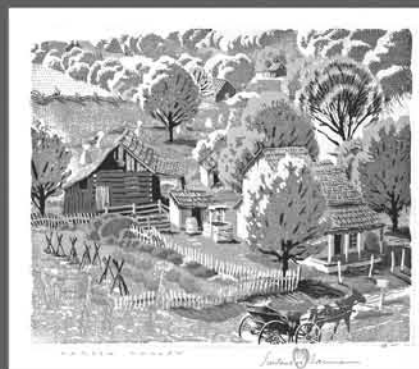
Gustave Baumann, Harden Hollow 10½ x 12 inches - Est. $7,000 - $9,000