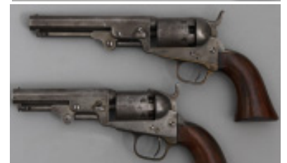
Colt Pocket Pistols, Model #1849