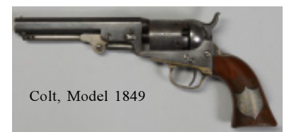
Colt, Model 1849