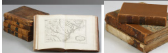
Le Petit Atlas maritime, 5 Volumes Lg. Qty. Historical Books