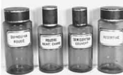
4 French Blue Apothecary Bottles