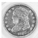
1836 Silver Half Dime