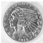
1915 Five Dollar Gold Piece