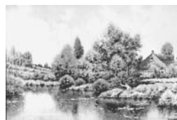
George H. Drew O/C landscape, signed LR, 19" x 29", sight