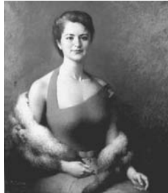
William Robinson Leigh O/C Portrait, signed LL "WR Leigh 1951, 42" x 36"