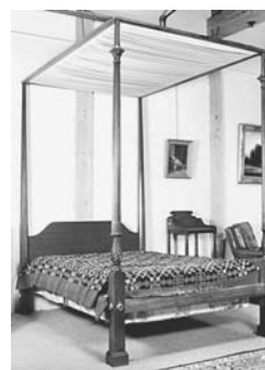
Chippendale style Canopy Bed, 54" wide