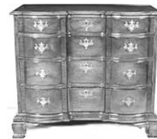
Chippendale Style Block Front Chest

Other books: 1715 Dictionaire Historique et Critique (3 vol plus E update); 1815 Dictionary of Arts & Sciences; 3 vol 1852 Crown Ward by A Boyd; Town & City Atlas, NH 1892; lots of art & photography; Hist of Hillsborough, NH; Arctic; Literature; Classical music scores & other music; Shakespeare; Napoleon Bonapart; 1866 Rambles of a Rat; British Authors; 4 Vol Journal Des Memoiselles; Approx 150 lots in total all to be listed on our web site.