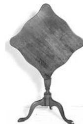
Kittinger Signed Candle Stand

Phone: 603-924-6361 ~ Fax: 603-924-9089 ~ Email: info@thecobbs.com ~ NH Lic #2366