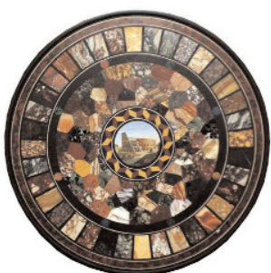
Amazing 19th Cent. Italian Specimen Marble & Micro Mosaic Table, 32 1/2" dia.