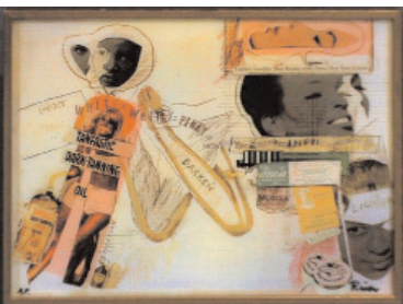
Larry Rivers (1923-2002), screenprint on plexi, signed, artist's proof, 17" x 23"