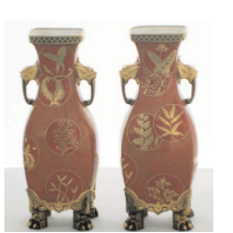
Royal Worcester Pair Chinoiserie, 13 3/4" h.