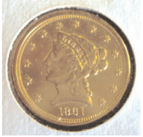
2.5 Dollar Gold 1861