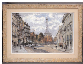
Pair 19th Cent. Minton Majolica Plaques, c.1876, 19 1/2" x 14 3/4"