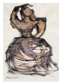
David Siquieros (1896-1974), pryloxine on paper, signed, 19 1/2" x 13 3/4"