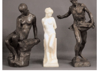
Bronzes & Alabaster Sculptures