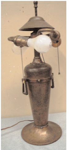
Roycroft Lamp Base

COMMENT: We are pleased to offer some fun and interesting merchandise from the Fitz-Gerald estate from Vergennes, Vt., an estate from Rutland, Vt. and from other homes in the area.