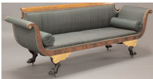
American Federal 19th Cent. Mahogany Sofa, 95" L.