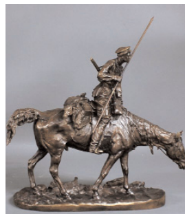
Russian Bronze signed "E. Lansere". 18" x 18"