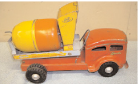
Lincoln Mixer Toy