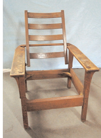
L&JG STICKLEY MORRIS CHAIR

Prozzo Auction Gallery, 207 North Main Street, Rutland, Vermont