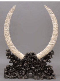
Important Carved to Death Pair of Chinese Export Ivory Tusks on Stand, 40" L.