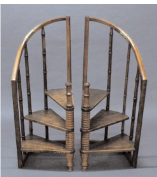
Rare Pair 19th Cent. Geo. III Library Steps

Featuring a Quality Selection of Fine Art and Antiques from a Palm Beach South Ocean Blvd. Penthouse; Fort Lauderdale Estate with a Majolica Collection & Antiques; 18th & 19th Cent. Italian & French Antiques from an El Cid, West Palm Beach Mansion; and much more from South Florida and the Palm Beaches.