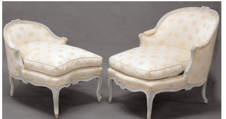
French Louis XV 18th Cent. Two-part Chaise Lounge, 83 1/4" L.