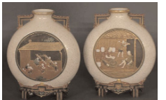
Royal Worcester Pair Chinoiserie, 10" h.

18th & 19th Century Furniture to incl. Amazing 19th Cent. Italian Specimen Marble and Micro-Mosaic Table Top; 18th Cent. Black Lacquered Chinoiserie Work Table, 18th Cent. Italian Serpentine Inlaid Commode, Pair 18th Cent. Fauteils, 1820 Federal Mahogany Sofa, Rare 18th Cent. French Provincial Case Piece with Clock, Rare Pair of 18th Cent. Library Steps, French 18th Cent. Gilded Marble Top Center Table, 19th Cent. Satinwood Inlaid Console, English Mahogany Brass Bound Bucket, Early 19th Cent. Mahogany Extension Dining Table, Pair Italian Painted Childs Chairs, Eight French Napoleon III Caned Dining Chairs, Three Chinese Black Lacquered Stacking Trunks, Pair Painted Trumeaus; Quality Smalls: Collection Royal Worcester; Daum Nancy Lamp; R. Lalique, Collection of Minton and French Majolica; Bronzes; Japanese Ivory & Boxwood Okimonos; Large Swedish Silver Covered Tankard, Pair