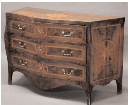
Italian 18th Cent. Inlaid Serpentine Commode