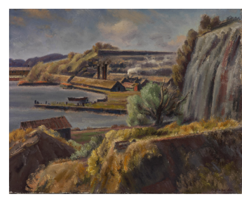
Eugene Speicher (1883–1962), "Brigham's Yard, Kingston," 1928. Oil on linen, 27 1/4 by 34 3/8 inches.

different American artists to the Utica museum.